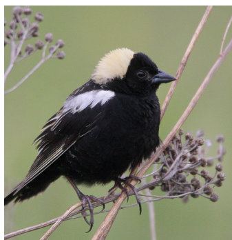
Bobolink