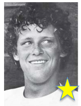
TERRY FOX: RUNNING TO THE HEART OF CANADA MARCH 7 TO MAY 27 The Dufferin County Museum & Archives is marking the 35th anniversary of Terry Fox's heroic Marathon of Hope by presenting a new travelling exhibition on the run and Terry's remarkable and continuing legacy.

Click Connect Group: Community Living Dufferin